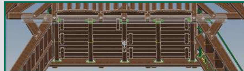
POST AND BEAM FLOOR JOIST SYSTEM